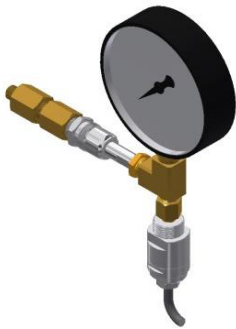
PX-PSM-24 shown above

Complete assembly of pressure/vacuum switch, 4" diameter pressure/vacuum gauge, and gas specific DISS union demand check valve. Entire assembly is cleaned for oxygen service