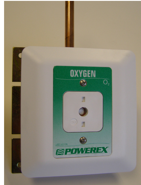
Part Number PX-DCN91XQ1124 shown

The outlet nameplate shall be permanently color coded with a durable, scratch resistant and protective label. The outlet trim plate shall be die cast aluminum, powder coated white, attached with the nameplate to the rough-in assembly, and provide automatic plaster adjustment from ½ to 1 ¼ of an inch (1.3 cm to 3 cm). The name of the gas service shall be permanently marked on the outlet bracket and the outlet. The outlet's rough-in supply tube shall be a 7 inch (18 cm) length of ½ OD copper Type K for all gas